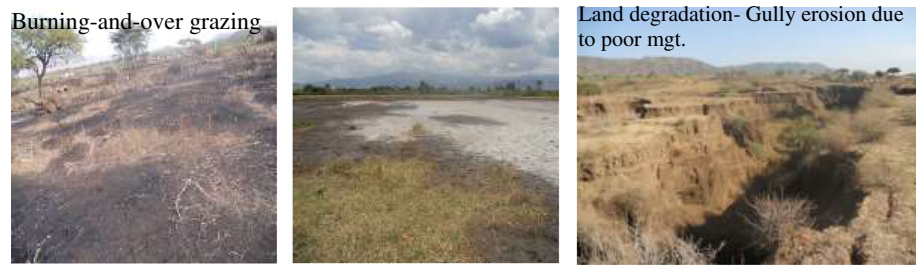
Fig. 5 Typical degraded land (burning and gully erosion) in the CSB

organisms and soil fauna. Biological degradation is the direct result of inappropriate soil management (Fig. 5). Soil organisms and SOM content can influence the physical structure of the soils, especially with regard to transportation within the soils, mixing mineral and organic materials, and changes in soil micropore volume (Doran and Parkin 1994). On-site soil degradation leads to declining soil productivity, which primarily threatens the livelihood of rural land users. Off-site impacts of soil degradation, such as flash floods, sedimentation of water reservoirs, water quality decline, mobile dunes, or dust storms, were affected society as a whole (Fig. 5). Physical degradation basically includes a negative impact on physical soil properties, such as structure, texture, aggregate stability, porosity, permeability (compaction), and crusting. According to Mitiku et al. (2006), in Ethiopia, the main causes for soil degradation are agricultural mismanagement (56%) and deforestation (28%). The most important causes of erosion by water are deforestation (43%), overgrazing (29%), and agricultural mismanagement (28%).