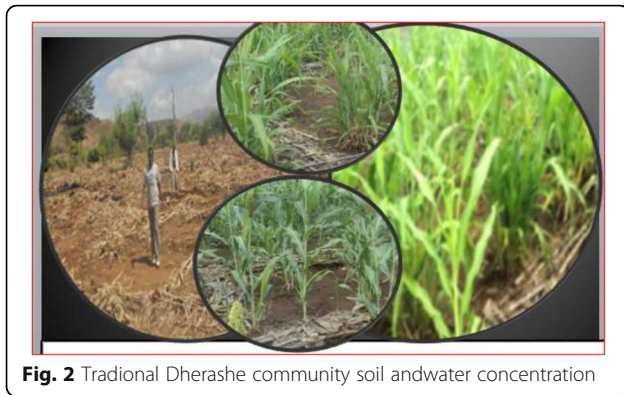
Fig. 2 Tradional Dherashe community soil andwater concentration

structures prevent massive flow of runoff and thus reduce the risk of erosion. Permanent return of residuals in Targa systems of AA of rainfed soils (P11) also had the potential to sequester carbon compared to AP-Moringa system of rainfed soils (P10). The Targa is a physical SWC method like terracing, whereby stalk of sorghum, maize, and other similar crops are piled in rows and placed at intervals of 2 to 3 m and utilized as an organic fertilizer (humus). Carbon sequestration rates are affected by the amount of plant residues (OM) introduced into the soil and the quality of the plant material (C to N ratio, lignin content, and phenolic compound content). Targa is a physical SWC practice like terracing in Konso area, whereby stalk of sorghum, maize, and other similar crops are piled in rows placed at intervals of 2–3 m and utilized as an organic fertilizer (humus). Legume inter-cropping with sorghum and maize is also another method used in the area to reduce SOM depletion.