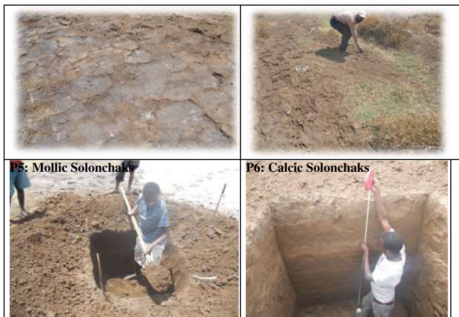
Fig. 3 Flooded Solonchaks. High salt content in the bare spots prevents the growth of even salt-tolerant plants

All Pedons had 2–9% CaCO 3 equivalent throughout the horizons, which was \geq 2\% CaCO 3 equivalent (Table 5) ranged low to moderate and physically visible effervescences of Calcaric soil material. Moreover, subsurface horizons for Pedons (P1, P2, P3, P4, P5, P6, P7, P8, P9, P10, P11, and P12) had CaCO 3 equivalent \geq 5\% (Table 5). Agriculturally, low levels of CaCO 3 enhance soil structural development and are generally beneficial for crop production (ISRIC I 2012). Accordingly, it is believed that ancient basement rocks lie under the whole Rift Valley consist of gneisses, which transform into granites and grandiosities. CaCO 3 is the main component of shells of marine organisms, snails, and eggshells. The presence of CaCO 3 indicates the precipitation of calcium in the form of carbonate and that calcium as CaCO 3 is due to high pH of 7.5 or above, resulting in the formation of CaCO 3 precipitates (Tayim and Al-Yazouri 2005). CaCO 3 concentrations in Pedons (P2, P4, and P5) were